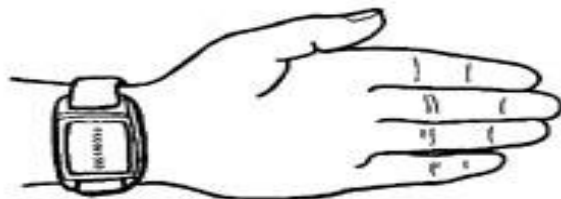
This special VNS magnet is worn on the wrist.

A magnet is used to activate the VNS when a child is having an aura or a seizure.